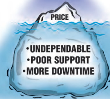
Price is just the tip of the iceberg when evaluating a lift purchase. Beware of hidden future problems.